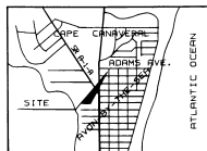
VICINITY MAP (N.T.S.)

LEGAL DESCRIPTION A REPLAT OF LOTS 7 AND 8, BLOCK 7, AVON-BY-THE-SEA AS RECORDED IN PLAT BOOK 3, PAGE 7, PUBLIC RECORDS OF BREVARD COUNTY, FLORIDA