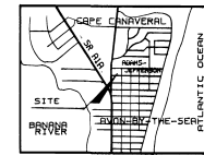
VICINITY MAP (N.T.S.)

A REPLAT OF LOTS 13 AND 14, BLOCK 7, AVON-BY-THE-SEA AS RECORDED IN PLAT BOOK 3, PAGE 7, PUBLIC RECORDS OF BREVARD COUNTY, FLORIDA